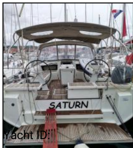
Yacht ID: 72719